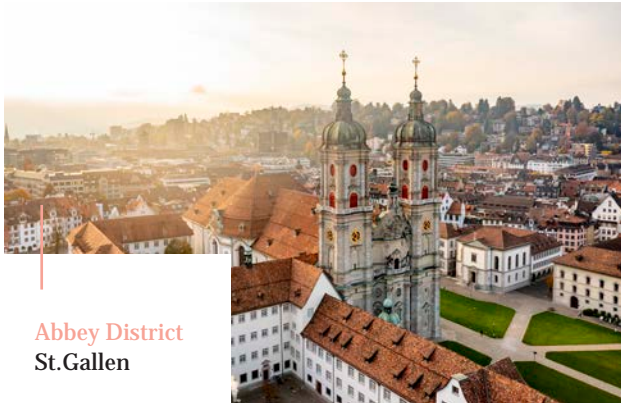
Abbey District St. Gallen